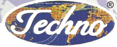
TABLE TOP SCALES